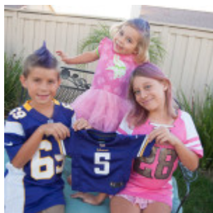
• Baby Reveal Outtakes